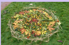
The Great Outdoors