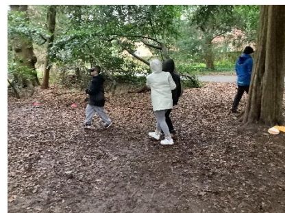
The children put their trust in each other to negotiate the obstacles..... ☺