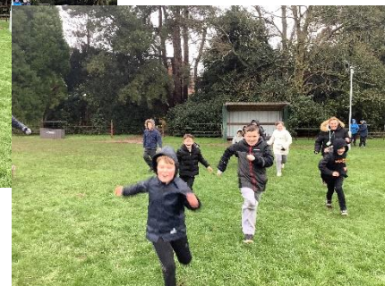
A race in the rain – no problem!!