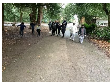
Setting off on the sensory trail...