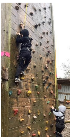
The climbing wall – two very brave children from Elm Class!