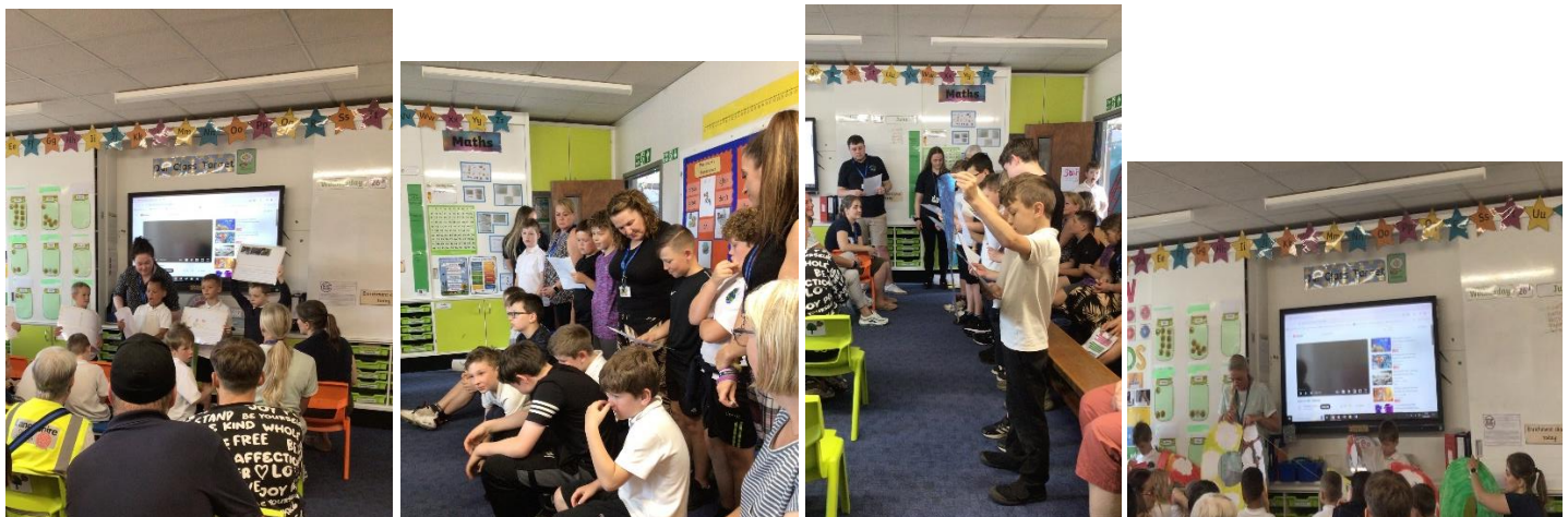
The children sharing their presentations.

All the children and staff had such a wonderful afternoon and the sun was shining! It was so lovely to see you all – thank you! 😊